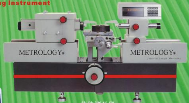
萬能測長儀 Universal Length Measuring Instrument