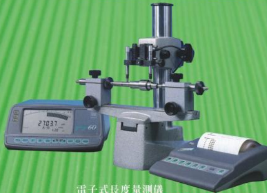
電子式長度量測儀 Electronic Length Measuring Instrument