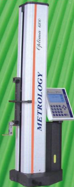
微電腦電子高度計 Micro Height Gauge