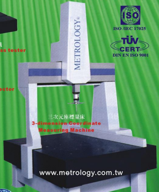
三次元座標量床 3-dimension Coordinate Measuring Machine