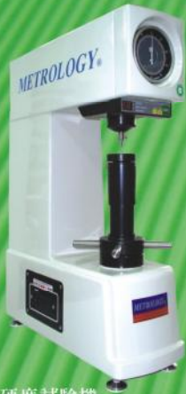
硬度試驗機 Hardness Tester