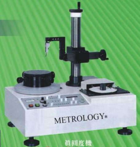
真圓度機 Roundness tester